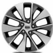
18" Alloys - A Type

'3' 1.7 CRDi 139bhp 6-speed manual ISG (113 g/km)