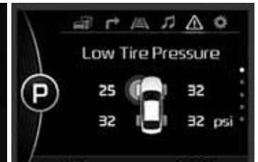
Tyre pressure monitoring system (TPMS) Keeps track of the pressure inside each of the tyres. It tells you which tyre is reporting under-inflation by displaying its pressure on the cluster screen.