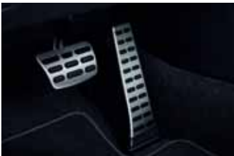
Alloy pedals ('GT-Line S') A must for the sporty driver.

Designed with the utmost attention to every detail and every finish, the All-New Optima is full of ingenious features.