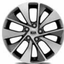
18" Alloys – A Type

'3' 1.7 CRDi 139bhp 6-speed manual ISG (110 g/km)