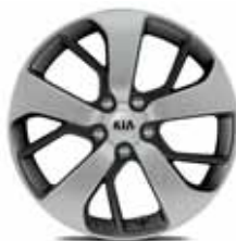
18" Alloys – B Type

'GT-Line S' 1.7 CRDi 139bhp 7-speed auto DCT ISG (116 g/km)