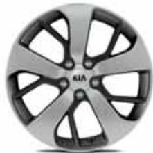
18" Alloys - B Type

'GT-Line S' 1.7 CRDi ISG 139bhp 7-speed auto DCT ISG (120 g/km)