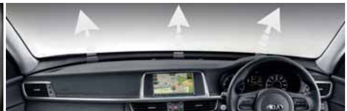
Automatic defog system Clear windows quickly in cold or humid climates to make sure your view is never obstructed.