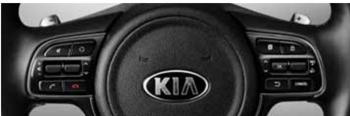
Paddle shift transmission (Sportswagon '3' DCT and 'GT-Line S' and Optima Saloon '3' DCT only). With paddle shifters at your fingertips, gear changes are guaranteed to be lightning-quick. Steering wheel mounted controls. Adjust the volume, change stations – and keep your hands on the wheel with the handy steering-wheel audio remote control.