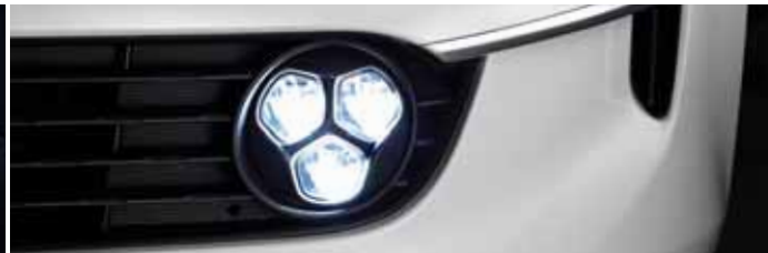
LED front fog lights ('3' grade) Stylish and practical, the LED front fog lights illuminate the road ahead when visibility is limited.